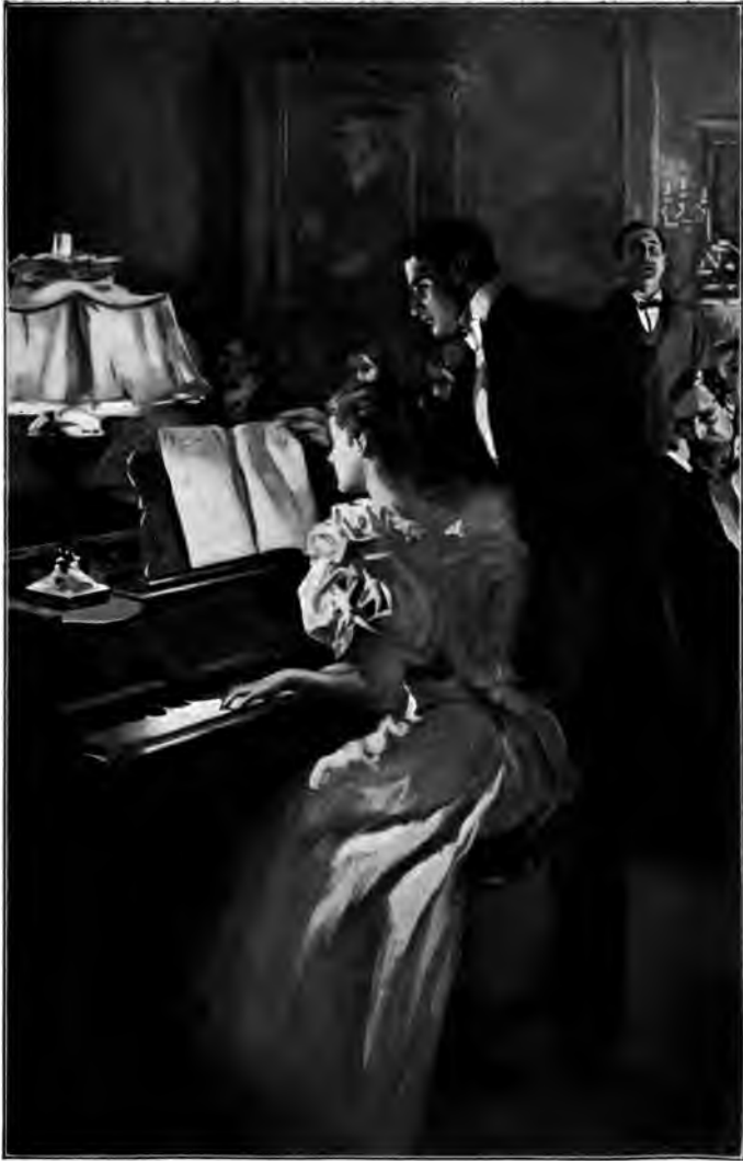
Marshall went at once to the piano.